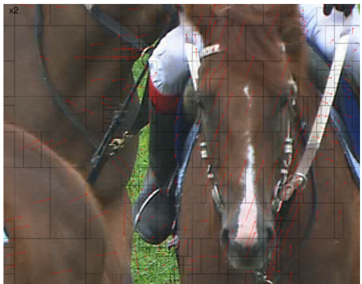
Figure 3: Motion vectors