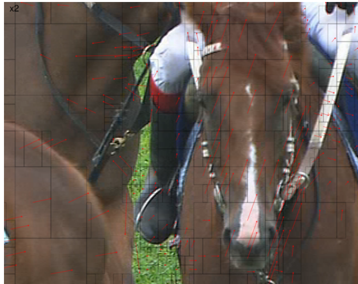
Figure 3: Motion vectors