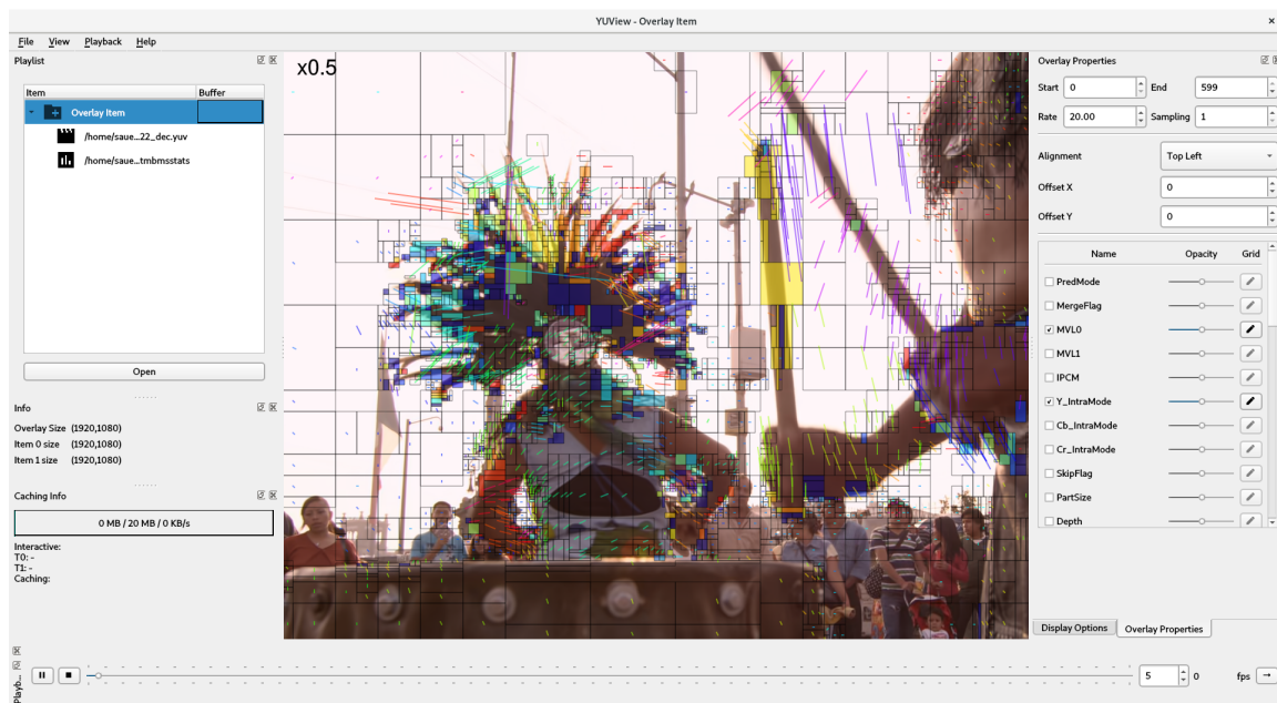
Figure 2: YUView

Statistics can be overlaid with YUV sequences. Some example snapshots are: