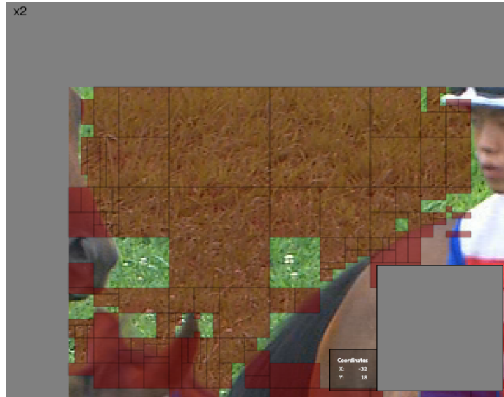
Figure 4: Skip flag