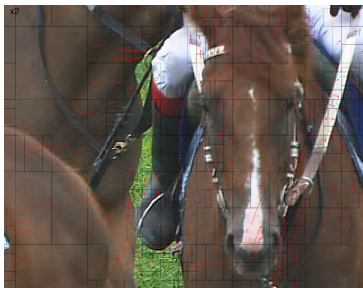
Figure 3: Motion vectors